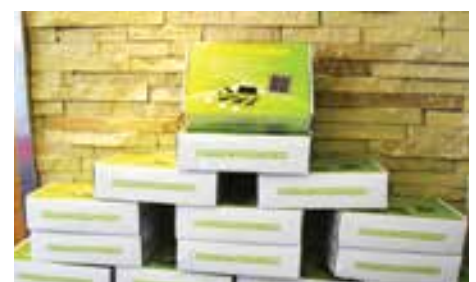
Solar power systems donated to the City of Windhoek