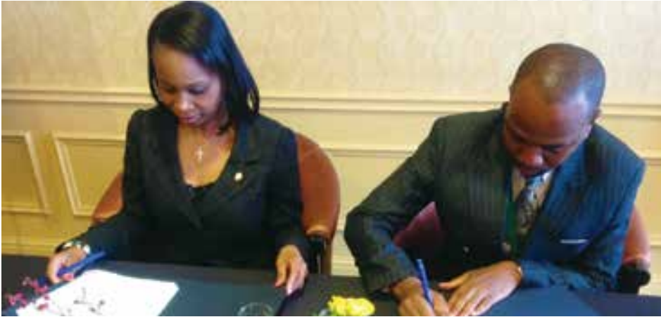
In the picture, San Antonio Mayor, Ivy Taylor and Cllr. Muesee Kazapua of City of Windhoek signing the co-operation agreement

The Cities of Windhoek and San Antonio, Texas in the USA, signed an agreement of friendship in San Antonio, on 21 April 2015. The signing followed protracted discussions facilitated by the Namibian Embassy in Washington over a period of years.